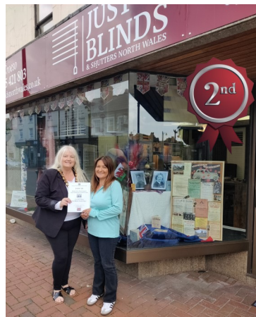
Ail Safle / Second Place Just Blinds