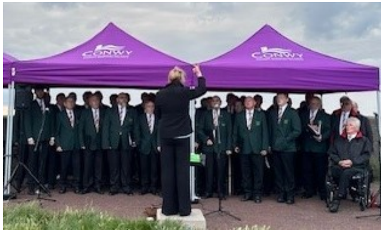
Cor Meibion Trelawnyd (below centre)