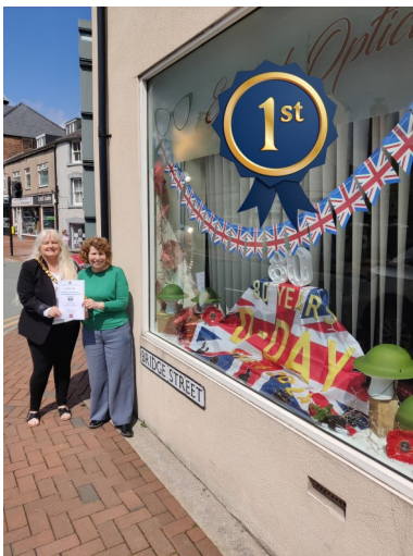
Safle Cyntaf / First Place Edwards Optician