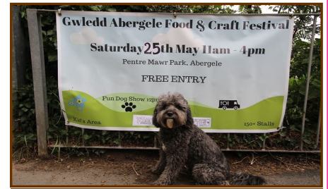
Fido - Fun Dog

The closing date for applications for 2020/21 is 31st October 2019